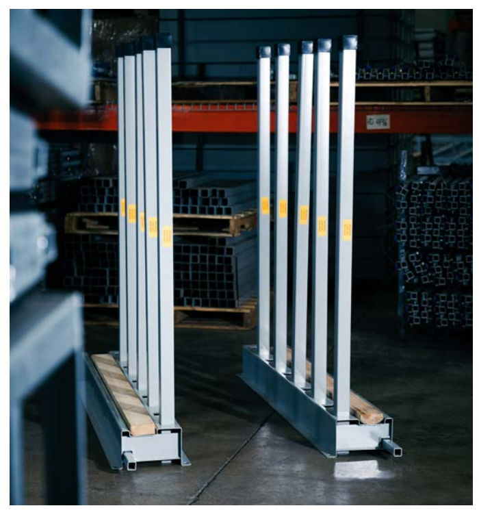
SHOWN: HEAVY DUTY BUNDLE RACK LONG

IF YOU HAVE QUESTIONS OR NEED HELP PLEASE CALL 1-800-991-2120