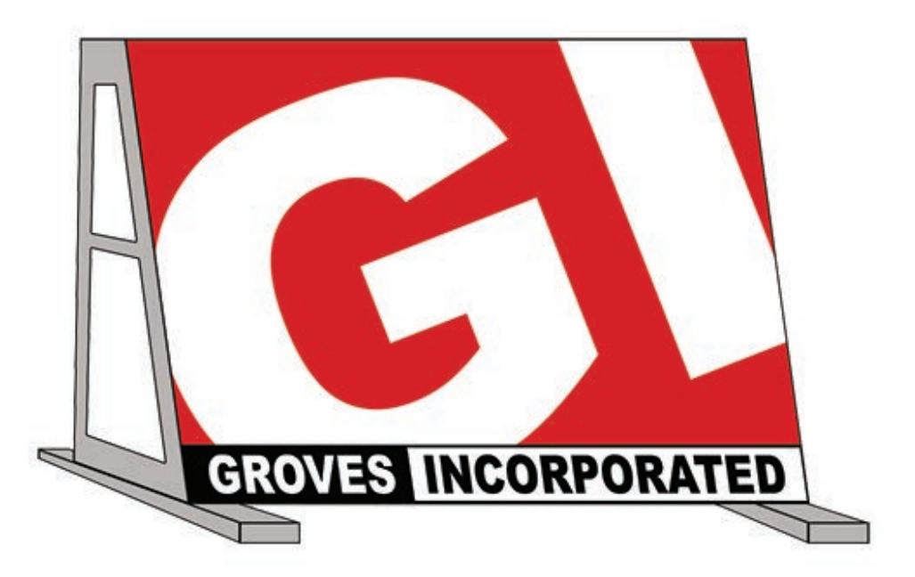
STRONGER. SAFER. SMARTER.

IF YOU HAVE QUESTIONS OR NEED HELP PLEASE CALL 1-800-991-2120