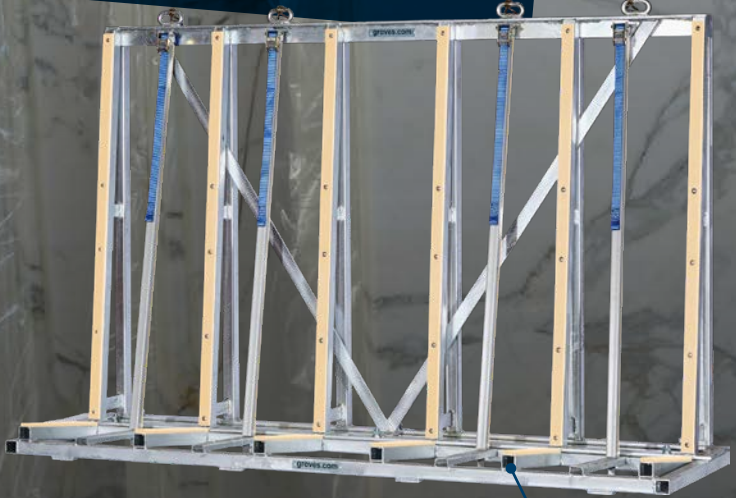
TRSS2482 | TRSS2496

Designed with beveled edges to cut down on material chipping when loading and unloading.