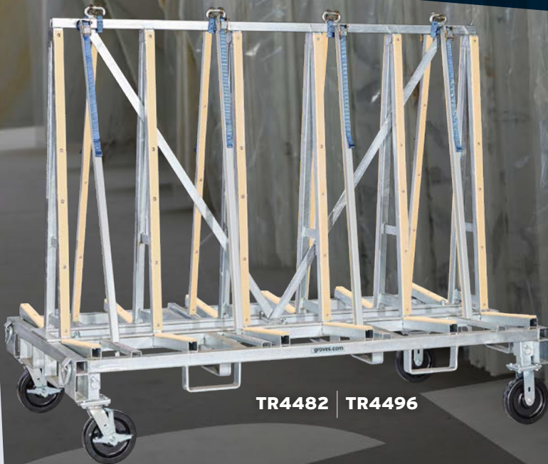
TR4482 | TR4496

Introducing Non-Marring PVC Strips THE ULTIMATE PROTECTION FOR YOUR RACKS!